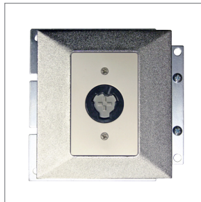
Electrical Twist Receptacle (HG) 20A Blk O-WAL-TWIST