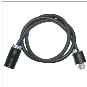
Cable Assembly - Twist M*F O-TWIST-CBL-DUB-XX