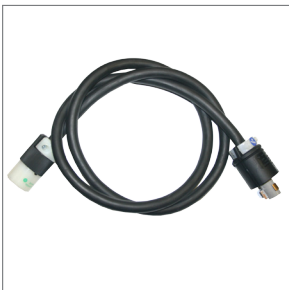
Cable Assembly - Twist M*F Simplex O-TWIST-CBL-SIM-XX